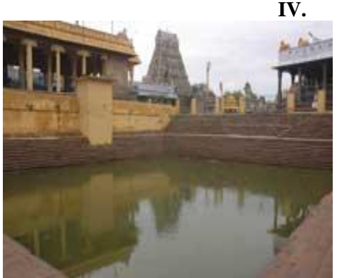
Figure 1: Temple Pond, Thiruvottiyur